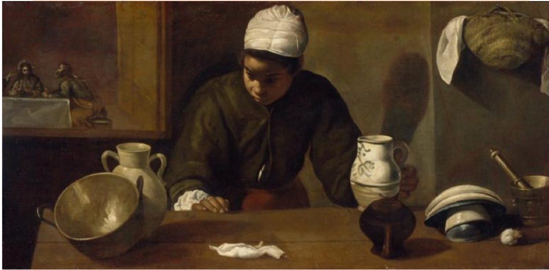
Diego Velázquez (1599-1660), 'Kitchen Maid with the Supper at Emmaus'

Sunday, April 23, 2023 THE THIRD SUNDAY OF EASTER 11:00 a.m. In-Person & Online